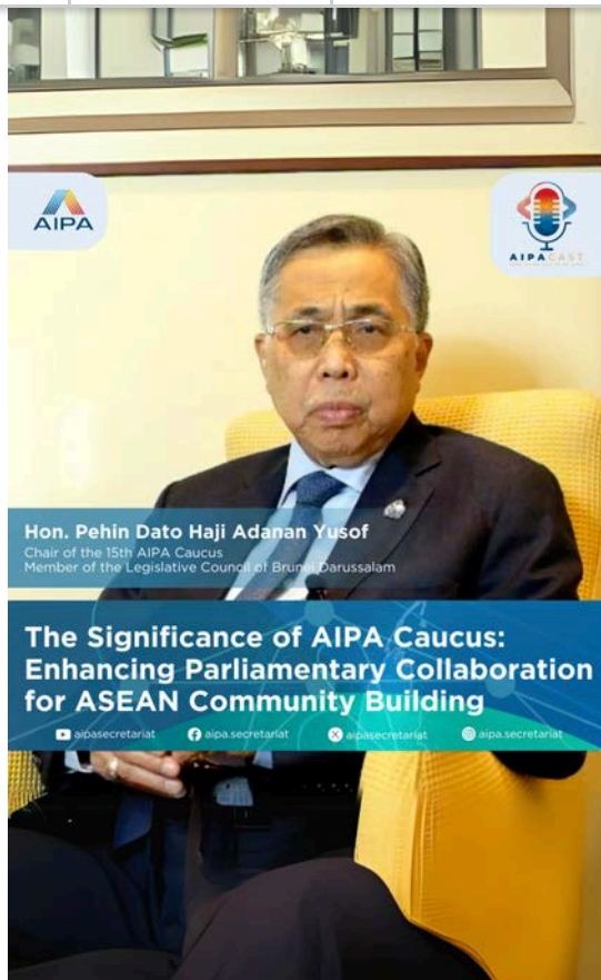
AIPACast Episode 6