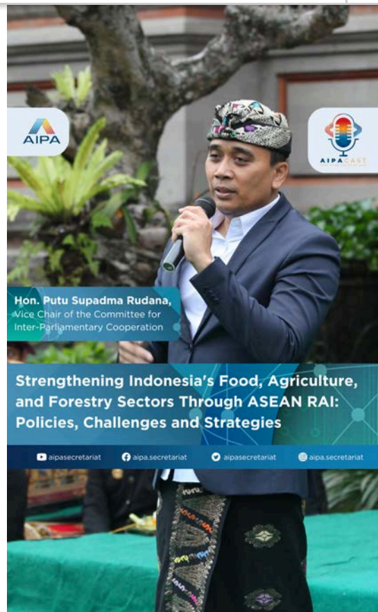
AIPACast Episode 7

Exciting updates from AIPACAST! This month, AIPACAST released two compelling episodes. Episode 6 features Hon. Pehin Dato Haji Adanan Yusof, Chair of the 15th AIPA Caucus, who discusses the significance of the AIPA Caucus and the vital role of parliamentary cooperation in strengthening cybersecurity.