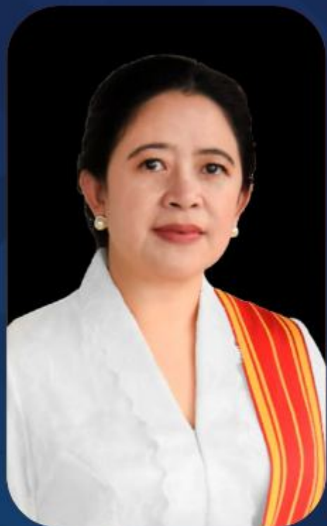
H.E. Dr. (H.C.) Puan Maharani